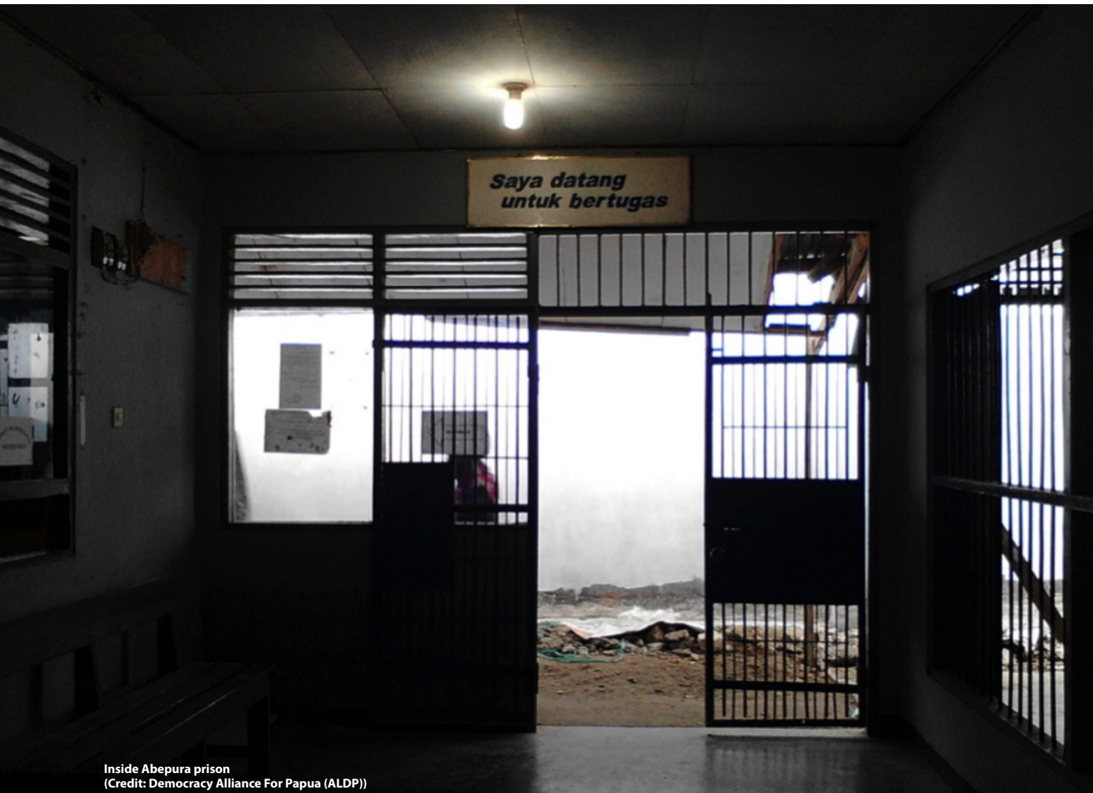
Inside Abepura prison

and Rights (AJAR) and TAPOL, documents acts of torture and inhuman treatment in Papua from the 1960's to the present. The purpose of the report is twofold. Firstly to highlight a pattern of ongoing torture taking place in Papua. Secondly, to encourage the Indonesian government to take effective steps to stop the on-going cycle of torture, take stock of the violations in the past and commit to forging a dialog based on the reality of the situation to ensure peace and security in Papua.