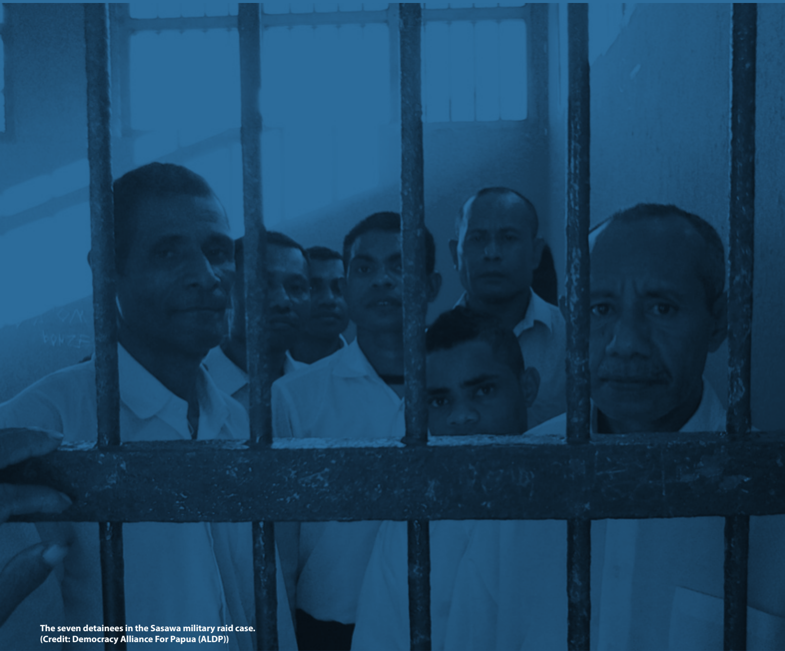
The seven detainees in the Sasawa military raid case.