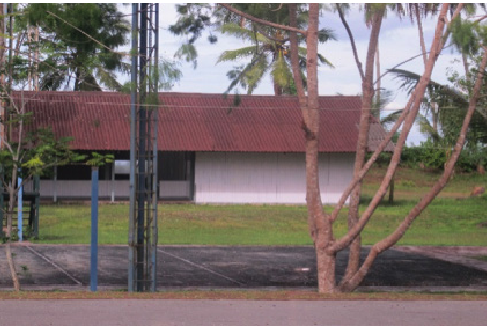
A military building where one of the survivors was tortured